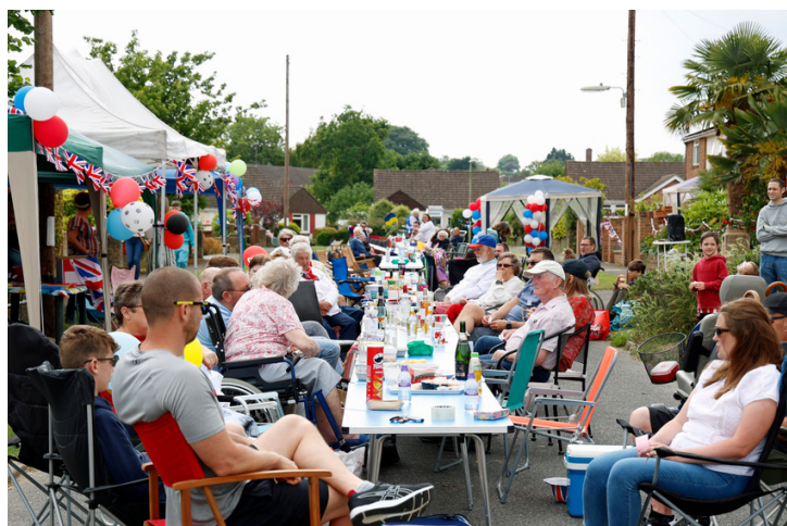
Residents enjoying their Queen's Platinum Jubilee street party at Portelet Place last Summer.

The centrepiece will be 'Lighting up the Nation', where iconic locations across the United Kingdom are illuminated using projections, lasers and drone displays.