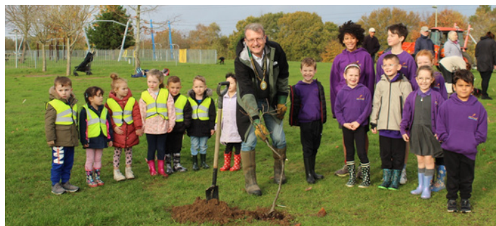
Planting the Community Woodland at Dowd's Farm

What a year it has been, and for the council, things do not stop - be it for celebrations, state funerals or coronations.