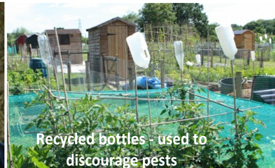
Recycled bottles - used to discourage pests