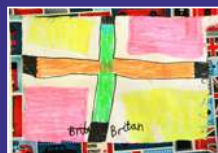
Bertie Killen. Age 7