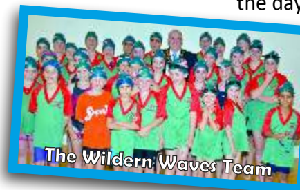
The Wildern Waves Team