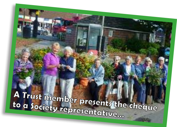
A Trust member presents the cheque to a Society representative...

The Hampshire Gardens Trust has contributed £200 to Hedge End Horticultural Society to provide shrubs for the Hedge End Town Green. Since last year the Society has ably taken over the care and maintenance of the Green from the Town Council.