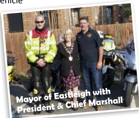
Mayor of Eastleigh with President & Chief Marshall

The Hampshire Fire and Rescue Service Community Contact Point vehicle was in attendance with plenty of information and also the opportunity to try a "ride simulator".