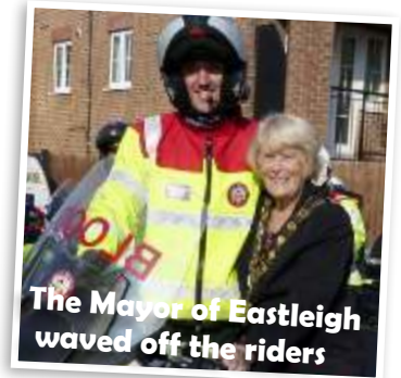
The Mayor of Eastleigh waved off the riders

Everyone seemed to agree that the ride had been very enjoyable and well marshalled and the Rotary club were very grateful to Budgens, Popham Airfield, Hampshire Fire Service, SERV-Wessex and of course everyone who took part, for their help and support.