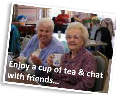
Enjoy a cup of tea & chat with friends...

We have speakers, quizzes or sometimes bingo to raise funds and we also have a weekly sales table.