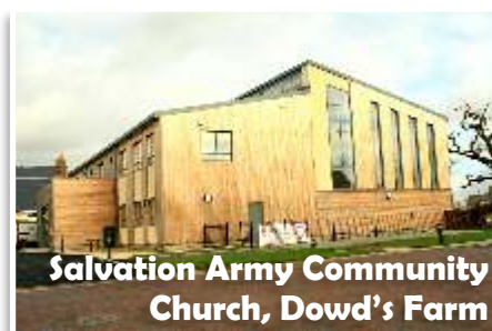
Salvation Army Community Church, Dowd's Farm