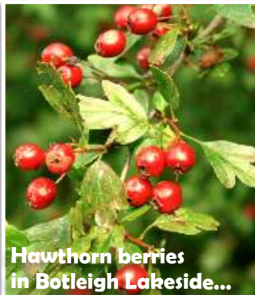
Hawthorn berries in Botleigh Lakeside...

Back home I saw some people gathering blackberries and plums. In and around Hedge End, it is evident that it has been a good year for some fruits as the ones alongside the roads and pavements show only too well. It has also been a very good year for both roses and hydrangeas, as well as a lot of other flowers seen in our gardens over the summer.