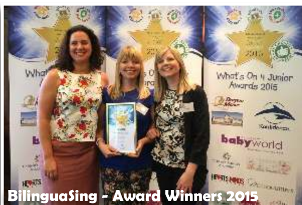
BilinguaSing - Award Winners 2015

For more information contact Lourdes on 07736 253375 or lourdes@bilinguasing.com