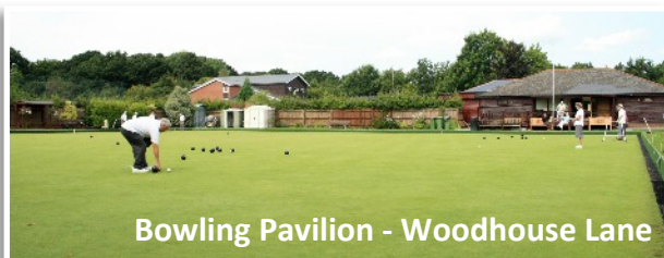
Bowling Pavilion - Woodhouse Lane

It won't be long before our outdoor bowls season will be ready. If you wish to have a casual game anytime, all the equipment is available at the 2000 Centre offices. If you wish to become a member of the club, you must apply to the Secretary of the club. Their details are on our 'What's On Guide' page within the Gazette.