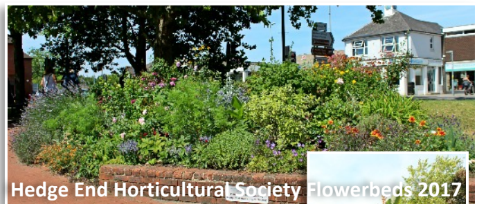
Hedge End Horticultural Society Flowerbeds 2017

Thank you to all the volunteers at the Hedge End Horticultural Society who keep the flower beds so well maintained in the town centre with a wonderful collection of flowers and shrubs.