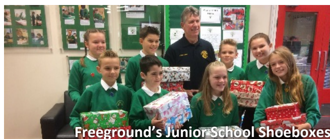
Freeground's Junior School Shoeboxes

The members of Hedge End Breakfast Rotary Club would like to thank all our friends from St. John's Church, Wildern School, Berrywood Primary School, Freegrounds Junior School, WYG Construction, the Hedge End over 60s Monday Club and all the other kind people who contributed Shoeboxes, for their magnificent support in last year's appeal. As well as all the generously filled shoeboxes, we were grateful for the large selection of additional items including books, pencils and three big bags of knitted things such as woollen hats, purses, scarves and other useful pieces of clothing. These proved to be very valuable and made the boxes that bit more exciting.