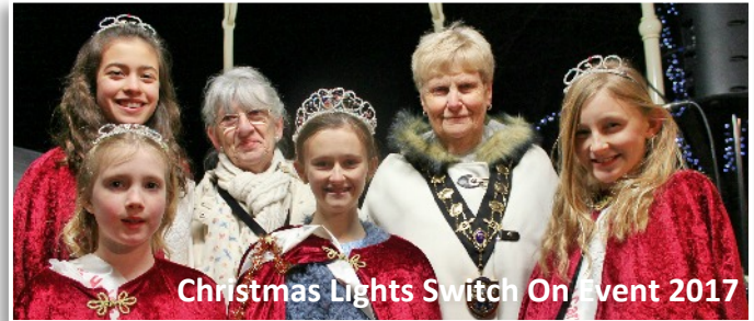
Christmas Lights Switch On Event 2017

Remembrance Day was a lovely sunny morning and 'it was very well attended by residents and youth organisations. Thank you to all that came to remember 11 November.