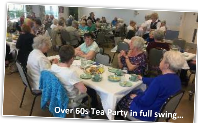
Over 60s Tea Party in full swing...

Spring arrived just in time for the popular annual Rotary Afternoon Tea Party for Hedge End Residents. On the sunny Sunday afternoon of 22 April, 75 very glamorous ladies and smart gentlemen joined members of Hedge End Rotary at the 2000 Centre in Hedge End Village where they were greeted with a glass of wine and enjoyed an afternoon of tea, sandwiches, cakes and even an ice cream cornet.