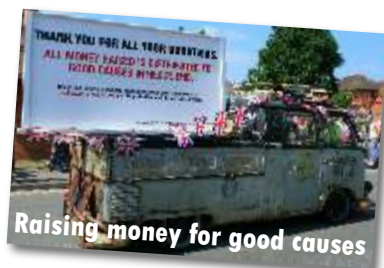
Raising money for good causes

supplied a carnival programme for you which should have dropped through your door inside the June edition of the HEDGE END & BOTLEY COURIER . More information is on the carnival website, for the most up to date news visit our Facebook page. See you there!