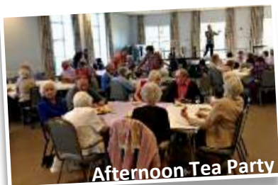
Afternoon Tea Party

Everyone was greeted with a glass of wine or a soft drink and shown to their table where members of the Rotary Club served them with tea, sandwiches, cakes, scones and ice cream.