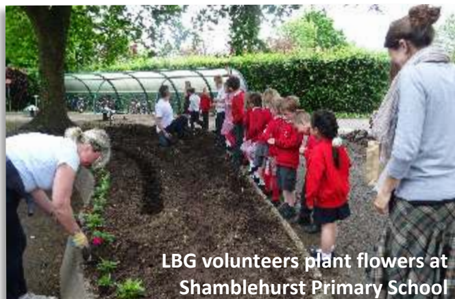
LBG volunteers plant flowers at Shamblehurst Primary School