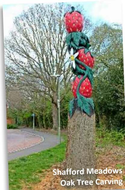
Shafford Meadows Oak Tree Carving

When an old tree dies, it is important to retain stumps and deadwood whenever it is safe to do so. They can provide a superb habitat and are also a wonderful ecological resource.