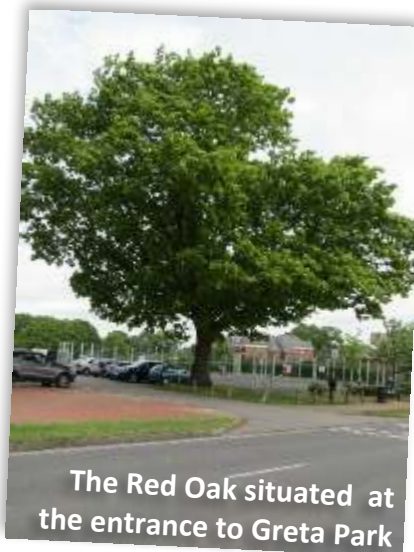
The Red Oak situated at the entrance to Greta Park

The Red Oak is located on the southern edge of the site adjacent to Upper Northam Road. It grows within a small area of grass which in turn is surrounded by a car-park, access road, basketball court, footpaths and the Library.