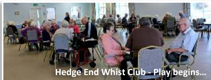
Hedge End Whist Club - Play begins...