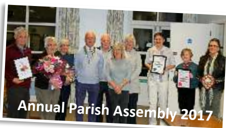
Annual Parish Assembly 2017