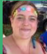
Kay Youth Support Team