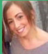
Emily Youth Support Team