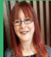
Ann Marie Youth Support Team