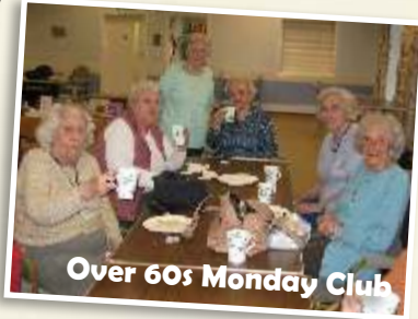
Over 60s Monday Club