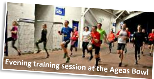
Evening training session at the Ageas Bowl